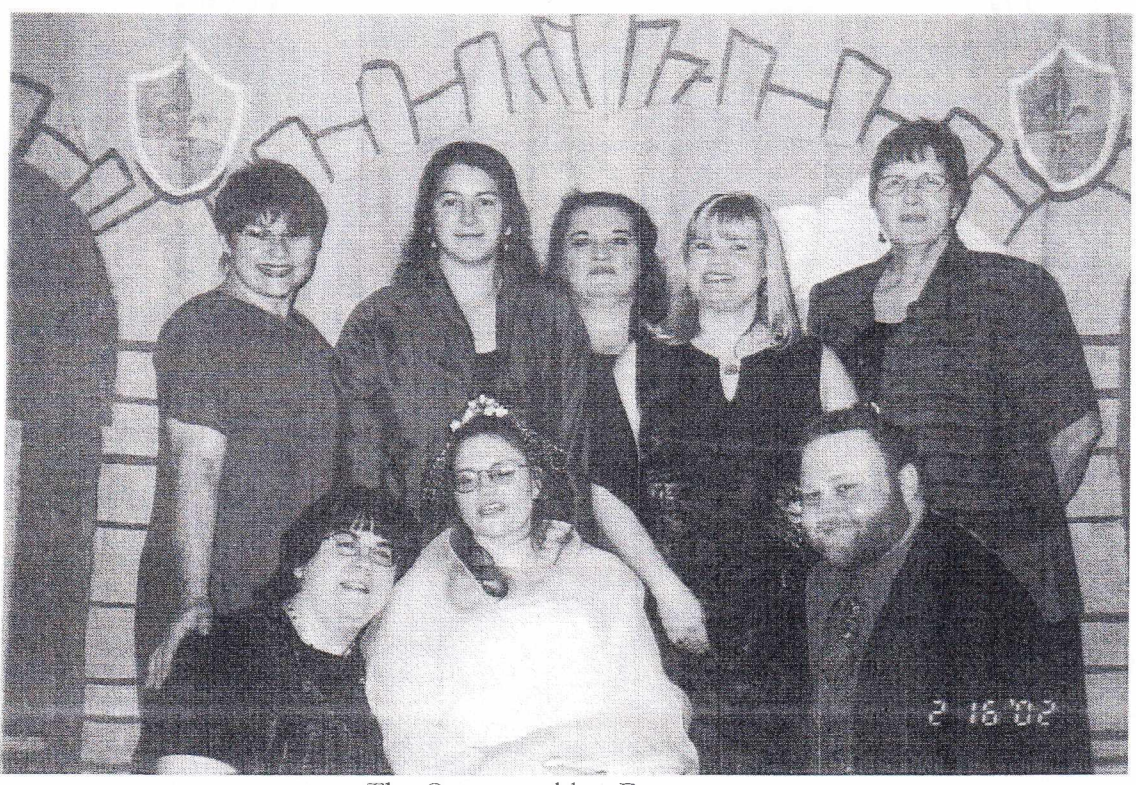
The Queen and her Decorators