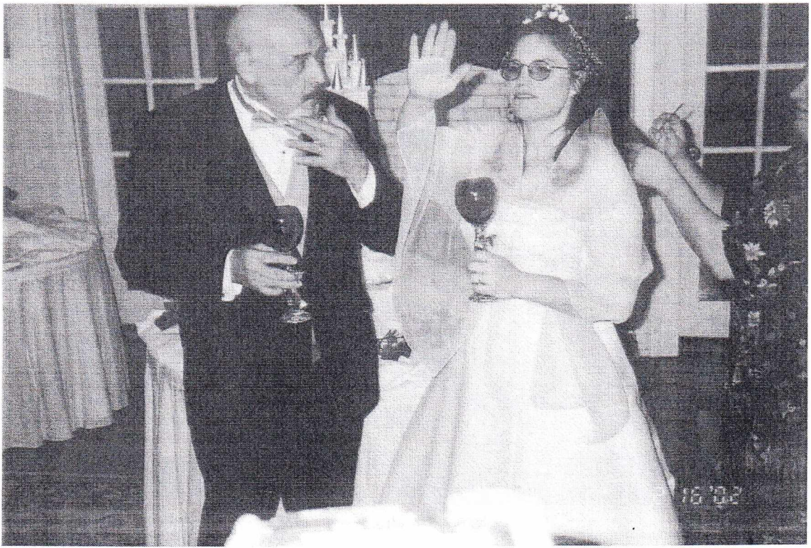
The Toasts (or Toni Just Smacked Hank)