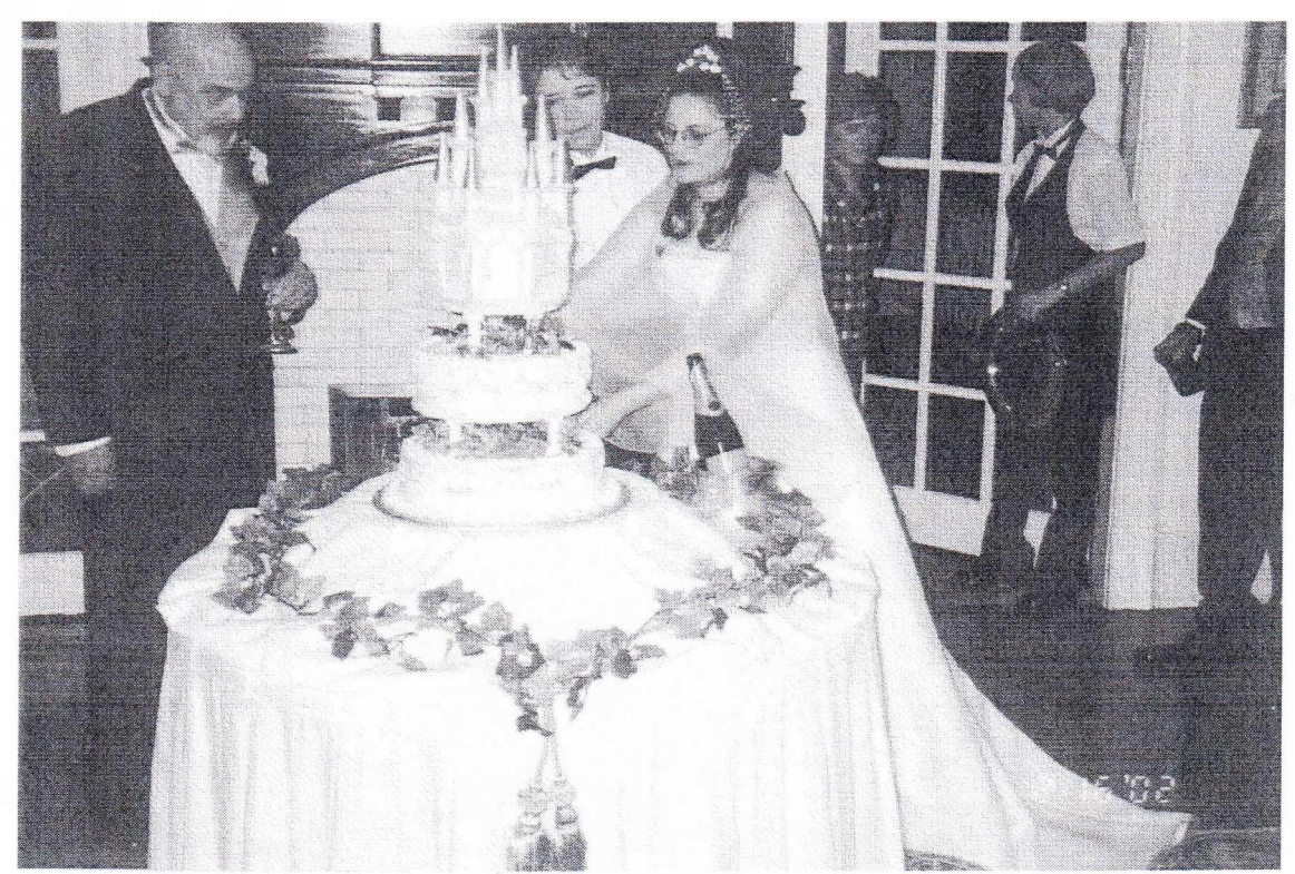
The Cake Cutting